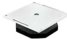
UV-C upper air CM SM355C SMB-DPP02