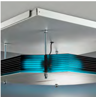
UV-C upper air CM SM355C SMB-DPP03