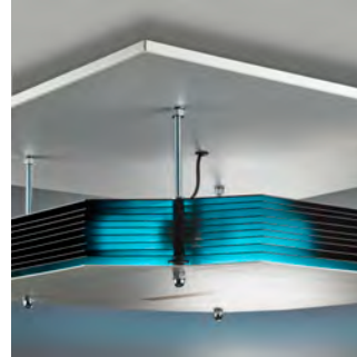
UV-C upper air CM SM355B-DPP03