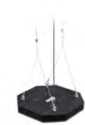
UV-C disinfection upper air suspended version