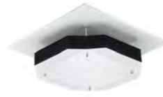
UV-C disinfection upper air Ceiling mounted version