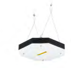
UV-C disinfection upper air Ceiling mounted version